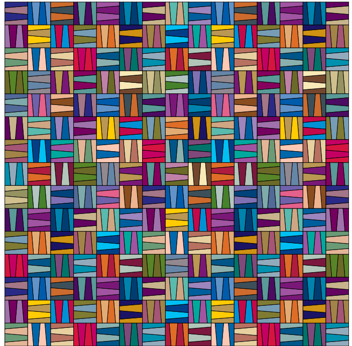
King Size Quilt Top Assembly Diagram