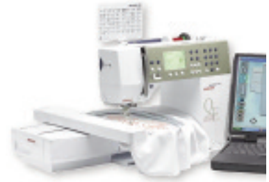
Bernina Aurora 440

Sewing machines used for the 900 series were the Bernina aurora 440 Quilters Edition and the Bernina artista 640 with Embroidery Module . For patchwork projects we used the Bernina #37 patchwork presser and the new #57 foot. Koala Cabinets provided the sewing center. We wore a Klutz Glove , a cut-resistant safety glove, while rotary cutting, used an Oliso Iron for pressing, and used Omnigrid and Fons & Porter rulers for measuring. In addition to the items listed on the following pages, we also used other basic sewing supplies (such as fabric, rotary cutters, scissors, and rulers).