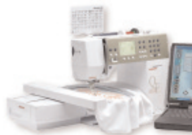
Bernina Aurora 440

Sewing machines used for the 800 series were the Bernina aurora 440 Quilters Edition and the Bernina artista 640 with Embroidery Module . For patchwork projects we used the Bernina #37 patchwork presser and the new #57 foot. Koala Cabinets provided the sewing center. We wore a Klutz Glove , a cut-resistant safety glove, while rotary cutting, used an Oliso Iron for pressing, and Omnigrid and Fons & Porter rulers for measuring. In addition to the items listed on the following pages, we also used other basic sewing supplies (such as fabric, rotary cutters, scissors, and rulers).