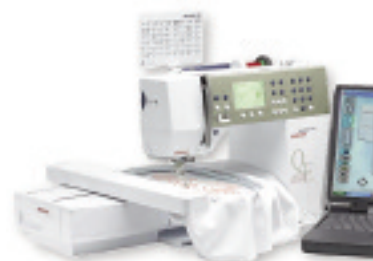
Bernina Aurora 440

Sewing machines used for the 1000 series were the Bernina aurora 440 Quilters Edition and the Bernina artista 640 with Embroidery Module . For piecing projects we used the Bernina #37 patchwork presser and the new #57 foot. Koala Cabinets provided the sewing center. We wore a Klutz Glove , a cut-resistant safety glove, while rotary cutting, used an Oliso Iron for pressing, and used Omnigrid , Omnigrip and Fons & Porter rulers for measuring. In addition to the items listed on the following pages, we also used other basic sewing supplies (such as fabric, rotary cutters, scissors, and rulers).